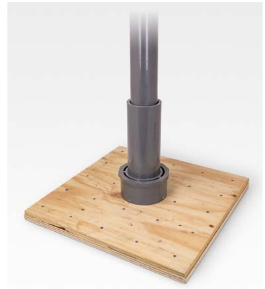
Model 4625-5SPA Slip Coupling for Protective sleeve