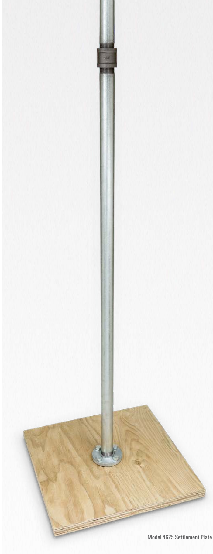
Model 4625 Settlement Plate