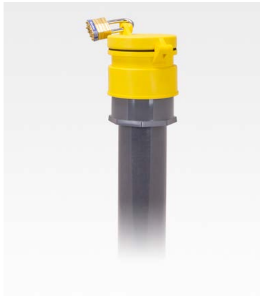
Model 4625-5WC Locking Cap for Protective Sleeve

4625-6: Oakum (oil treated Jute), three 27" strands.