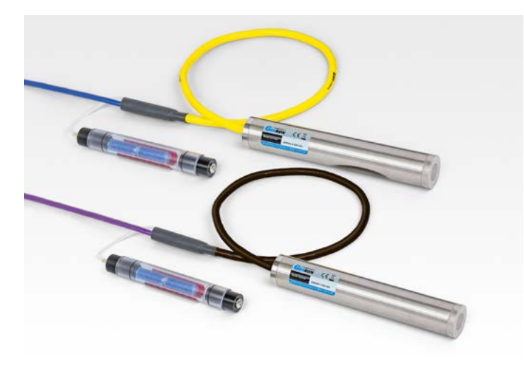
Model 3400SV Vented Semiconductor Piezometer.

Piezometers incorporate a filter stone ahead of the diaphragm, which allows the fluid to pass through but prevents soil particles from impinging directly on the diaphragm. Standard porous filters are stainless steel. High air-entry ceramic filters are available for use in applications requiring that air be prevented from passing through the filter.