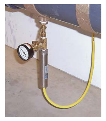
Model 3400H and Dial Gauge Pressure Transducer on a tee fitting.