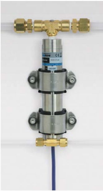
Model 4655 Multipoint Settlement System, vibrating wire pressure transducer.